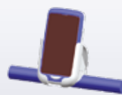
91ACC0047 Trolley Holder (60 pcs)