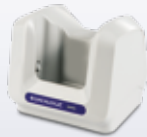
91ACC0072 Single Slot Cradle Locking