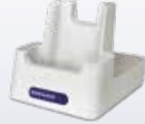
91ACC0073 Single Slot Cradle Charge only